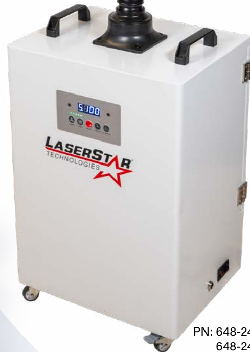
PN: 648-249-35-1 (120V) 648-249-35-2 (220V)