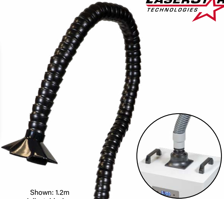
Shown: 1.2m Adjustable Arm