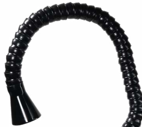
Shown: 1.2m Adjustable Arm

★ Excellent for Laser Welding, Marking+Engraving, Cutting, Soldering, 3D Printing, Craft & D.I.Y.