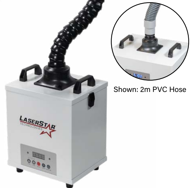
Shown: 2m PVC Hose

★ Bag Filters Capture Precious Alloys for Refining