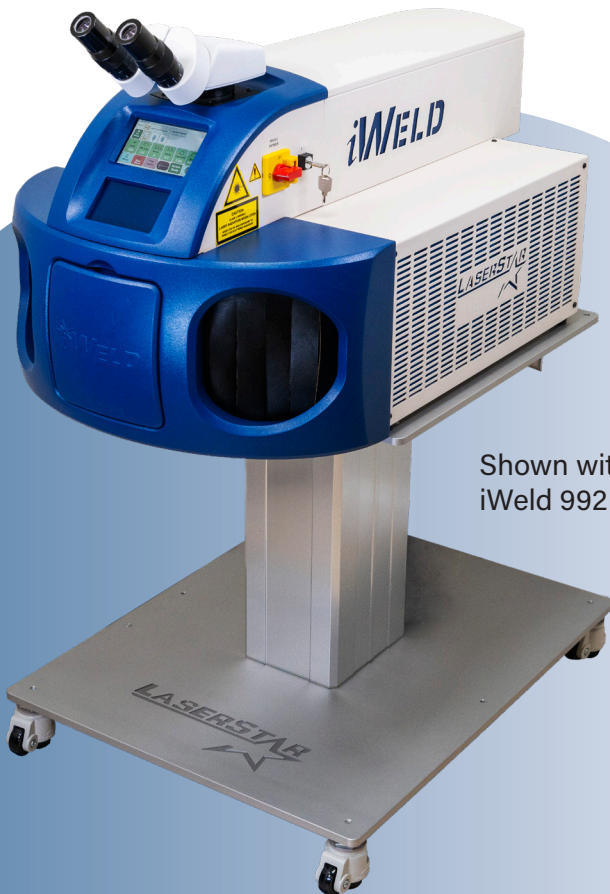
Shown with the LaserStar iWeld 992 Benchtop System