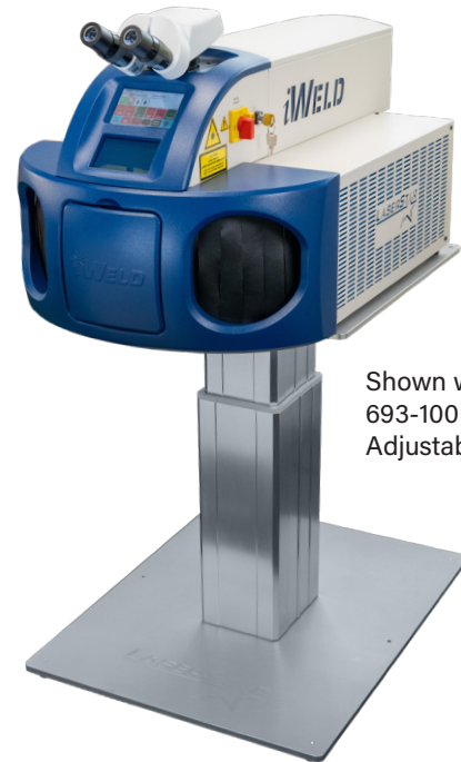
Shown with optional 693-100 Aluminum Adjustable Floor Stand

The system's compact, portable, space-saving design, coupled with LaserStar's well-known reputation for high quality, efficient laser sources, make the iWeld BenchTop an excellent value.