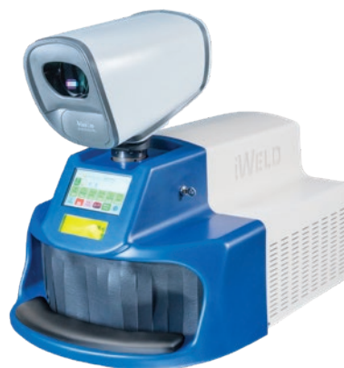
Shown with 611-197-1 Stereo Projection Scope