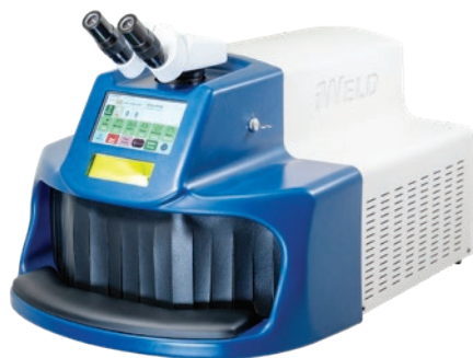
Shown with 611-160 ClearView Microscope

The system's compact, portable, space-saving design, coupled with LaserStar's well-known reputation for high quality, efficient laser sources, make the iWeld BenchTop an excellent value.