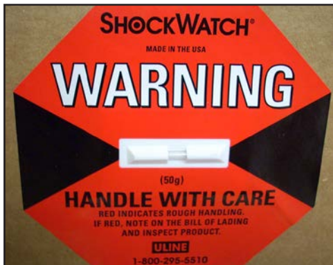
Tube is not red: (no shock warning)