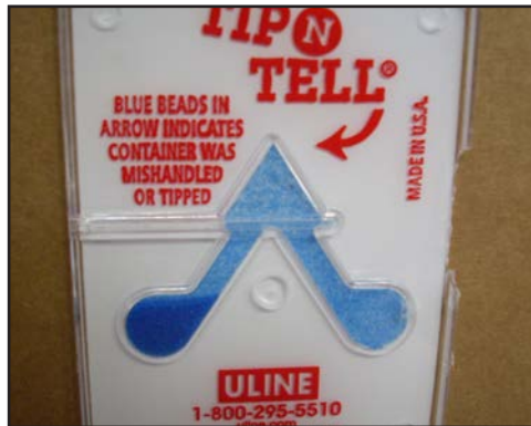
Blue beads present: (crate has been tipped)