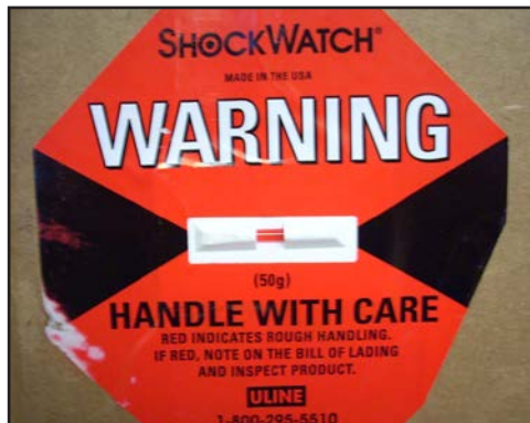
Tube is red: (shock warning)