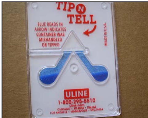
No blue beads present: (no tipping of crate)