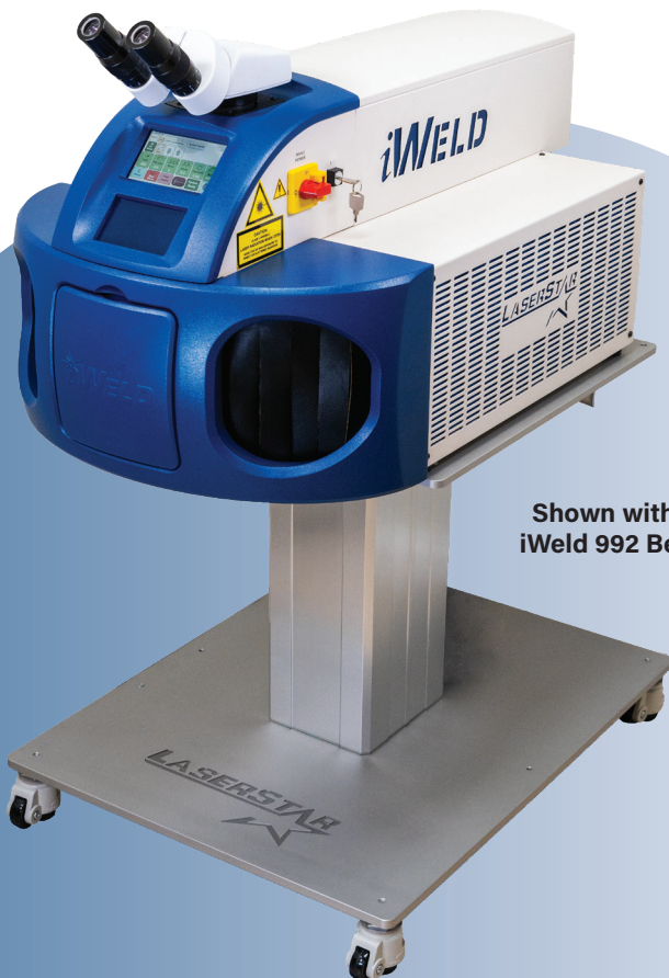
Shown with the LaserStar iWeld 992 Benchtop System