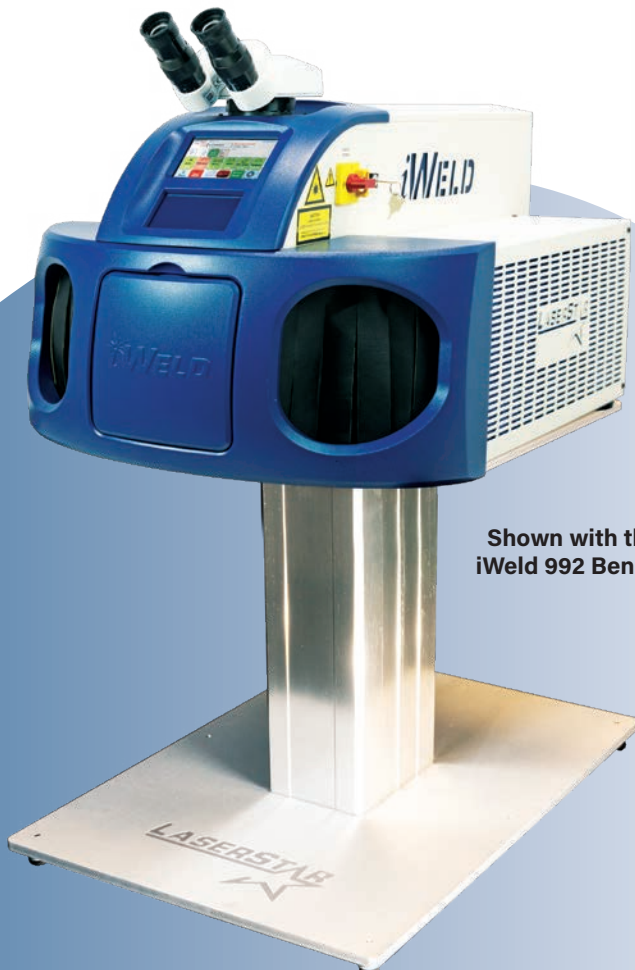
Shown with the LaserStar iWeld 992 Benchtop System