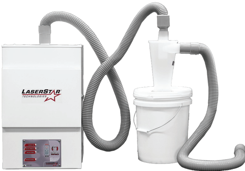
Shown: Industrial Exhaust Unit & Cyclone PN 648-249-15C

Note: The technical specs can vary depending on laser.