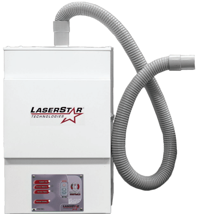
Shown: Industrial Exhaust Unit PN 648-249-15