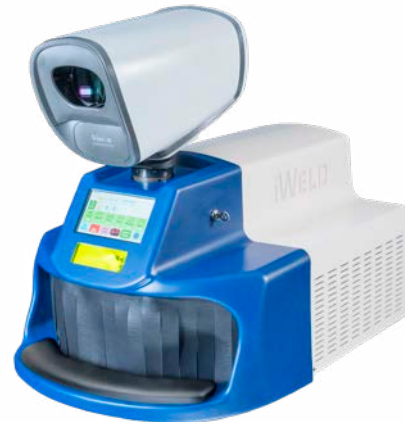
Shown with 611-197-1 Stereo Projection Scope