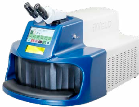
Shown with 611-160 ClearView Microscope

* Smaller sizes are achievable with an aperture kit for micro-welding.